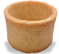
Savory Case Count: 360 #11112 Diameter: 1.7" Height: 1.0"