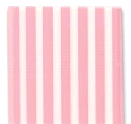
Domino Square Pink/White 525ct Tray #23007 1.4" x 1.4"