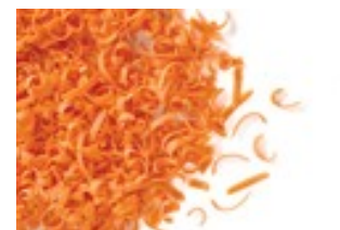
Spaghetti Orange 6# Case #23052