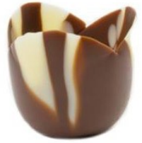
Petite Four Tulip Marbled