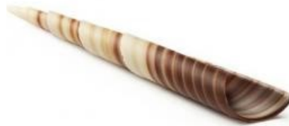
Turitella 117ct Tray #23089 3.8"