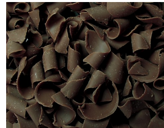
Curls Dark Chocolate Blossom 12# Case #23058