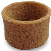
Graham Case Count: 360 #11486 Diameter: 1.7" Height: 1.0"

straight edge | locally made | all butter chocolate, graham & vanilla shells