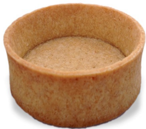
Savory Case Count: 216 #11126 Diameter: 2.2" Height: 1.0"