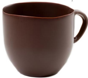
Coffee Cup Dark