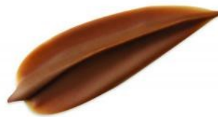
Elegance Milk 160ct Tray #23088 2.4" x 0.9"