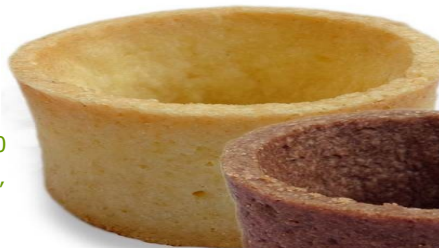
Vanilla Case Count: 90 #11487 Diameter: 3.3" Height: 1.0"