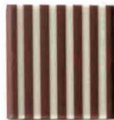
Domino Square Dark/White 525ct Tray #23046 1.4" x 1.4"