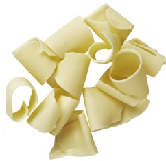
Ivory Curled Shavings