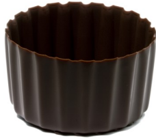
Dark Chocolate Angelo Cup