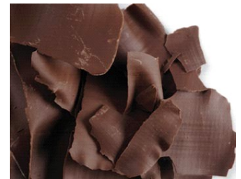
Dark Shaving 5.5# Case #23059