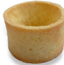
Vanilla Case Count: 360 #11484 Diameter: 1.7" Height: 1.0"