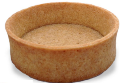
Savory Case Count: 90 #11132 Diameter: 3.3" Height: 1.0"