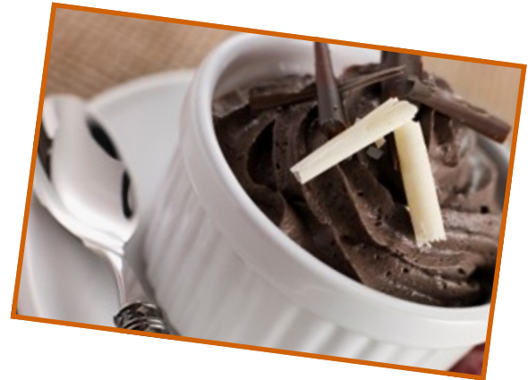
Mousse Mix 8/1# Bags • 180/3oz portions Dark Chocolate Mousse #23145 White Chocolate Mousse #23150