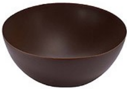
Grand Bowl Semi Sweet