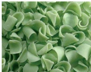
Curls Green Chocolate Blossom 12# Case #23073