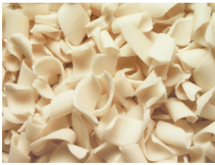
Curls White Chocolate Blossom 12# Case #23071