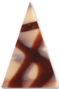
Diablo Triangle 290ct Tray #23041 1.3" x 2.0"