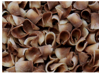
Curls Marble Chocolate Blossom 12# Case #23068