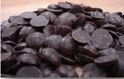
Zaire Dark Couverture 57% 2/11# Bags #23102