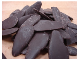
Superbrill Dark Dipping Chocolate 22lb Case #23095