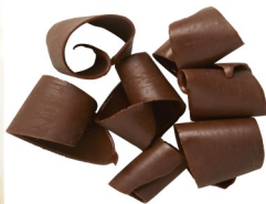
Semi Sweet Curled Shavings