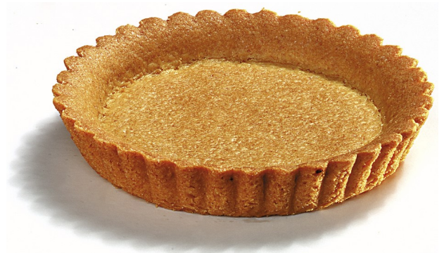
Tart Shell Buttered 4" Fluted Edge 72ct Case #23170