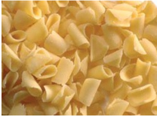
Curls Yellow Chocolate Blossom 12# Case #23072