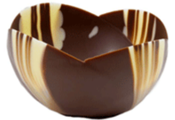
Tulip Large Marbled