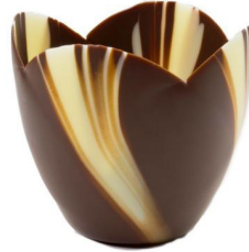
Tulip Medium Marbled