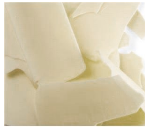
White Shaving 5.5# Case #23060