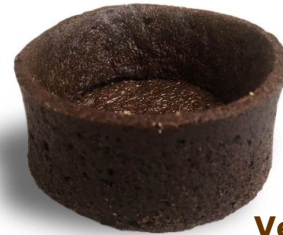
Very Chocolate Case Count: 216 #11414 Diameter: 2.2" Height: 1.0"