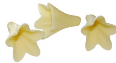
Ivory Flower Small