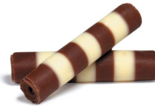
Duo Mistral 1" 1250ct Tray #23061