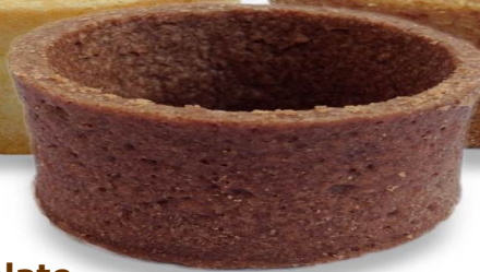
Chocolate Case Count: 90 #11488 Diameter: 3.3" Height: 1.0"