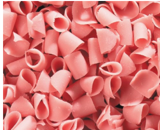
Curls Pink Chocolate Blossom 12# Case #23067