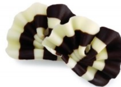
Forest Shaving Mini Dark/White 500ct Tray #23124