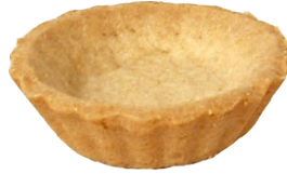
Tart Shell Mini Buttered 1.75" (Sugar Dough) 216ct Case #23171