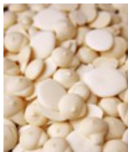
Superbrill White Dipping Chocolate 22lb Case #23096