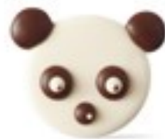
Panda 105ct Tray #23056