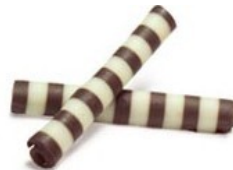
Twister Dark/White 1" 3150ct Tray #23043