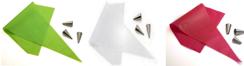
Pastry Bags 100ct "Comfort Green" #23112 • 100ct "Cool Blue" #23147 • 74ct "Red Hot" #23161