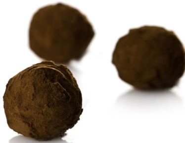
Cocoa Powder 21% (Alkalized Cocoa) 2.2lb Bag #23120