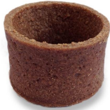
Chocolate Case Count: 360 #11485 Diameter: 1.7" Height: 1.0"