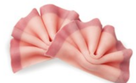
Forest Shaving Midi Pink 500ct Tray #23127