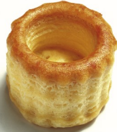
Bouchees Mini 1.25" (Vol-Au-Vent) 192ct Case #23155