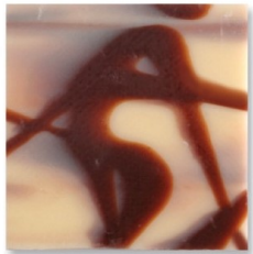
Diablo Square 465ct Tray #23033 1.4" x 1.4"