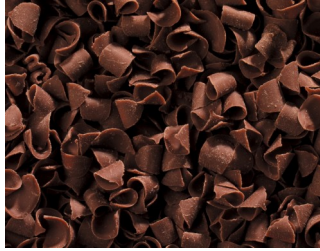
Curls Milk Chocolate Blossom 12# Case #23069