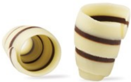
Rose Duo Chocolate 180ct Tray #23015 .70" x 1.0"